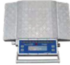
PT300™ Wheel Load Scales Pages 14-15