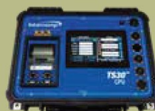
TS30™ Touchscreen CPU