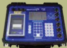
PT20™ Weighing CPU