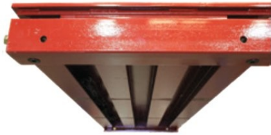
I-Beam Construction ▲

The CAS RW-X200 Series Heavy Duty Portable Axle Weigher is a versatile, self contained, pit-type, or above ground steel deck axle scale that is built to last. Its heavy duty, open bottom I-beam construction consists of wide flange structural I-beams and a ½" deck