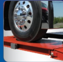
Superior Strength & Durability