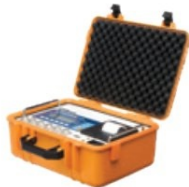
▲ RW-2601P Indicator