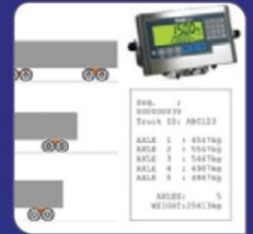
Truck Weighing with the R423 Stainless Steel Indicator