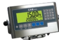
▲ R423 Stainless Steel Indicator