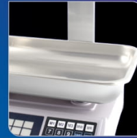
Optional Fish Pan