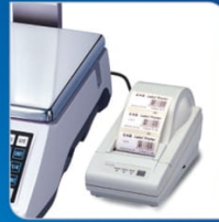
Optional Label Printer