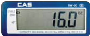
▲ Oz: SW only