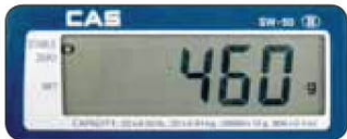
▲ Grams: SW only