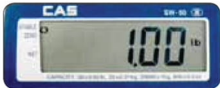
▲ Lb: SW & SW-Z