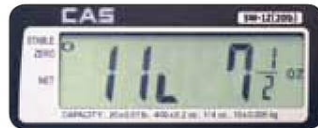
▲ Lb:oz fraction: SW-Z only