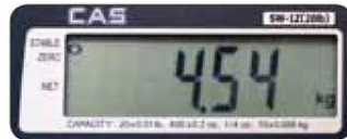
▲ Kg: SW & SW-Z