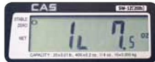
▲ Lb:oz decimal: SW-Z only