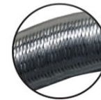
Heavy-duty metal cables with water-proof protective outer coating