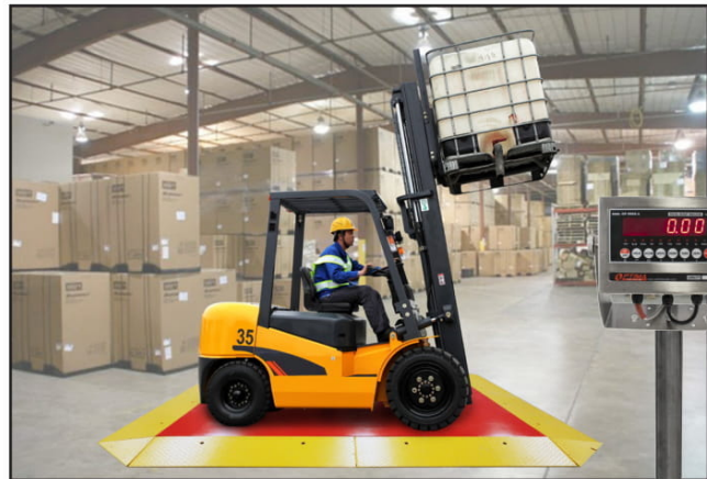
The 5x6ft version fits a standard size forklift on its deck