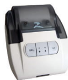
Optional Table Printer