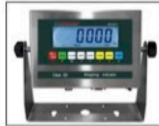
Built in Scale with Display