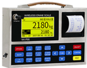
SS Printing Indicator