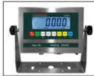
Built in Scale with Display