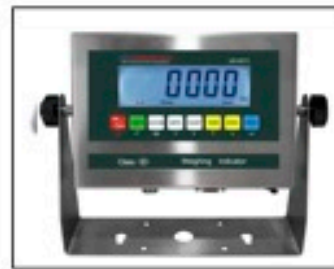
Built in Scale with Display