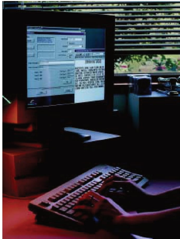
MX400 Management Software showing WYSIWYG text editor.

Our M series scales are fully ready for the EAN barcode regulations due on 01/01/2005.