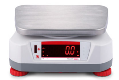
Rear Display with Integrated Touchless Sensor