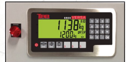
8500 VERSA PANEL MOUNT