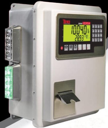
8500 VERSA KIOSK FOR TRUCK SCALE