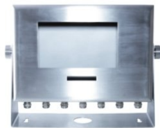
Housing in stainless steel