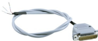
LX300 printer cable