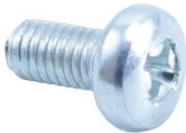
Screw M3 x 0,5