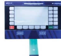
Panel with keyboard