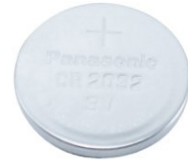
Battery lithium 3V 20mm