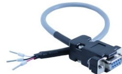
Serial RS232 cable