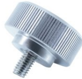
Bracket fixing knob