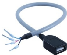
QWERTY Keyboard cable