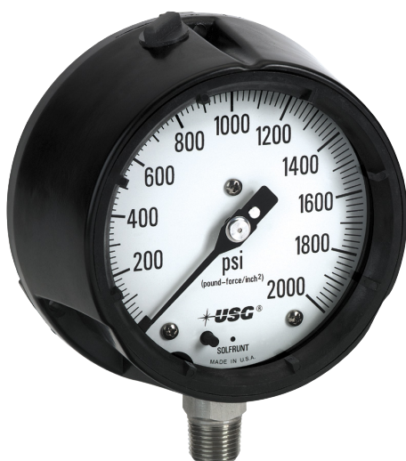
SOLFRUNT Model 1980

CONNECTION: Brass, 1/2-14 ANPT standard (1/4-18 ANPT, optional)