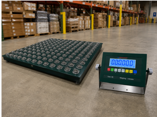
48" x 48" mild steel deck with 100+ stainless ball bearings